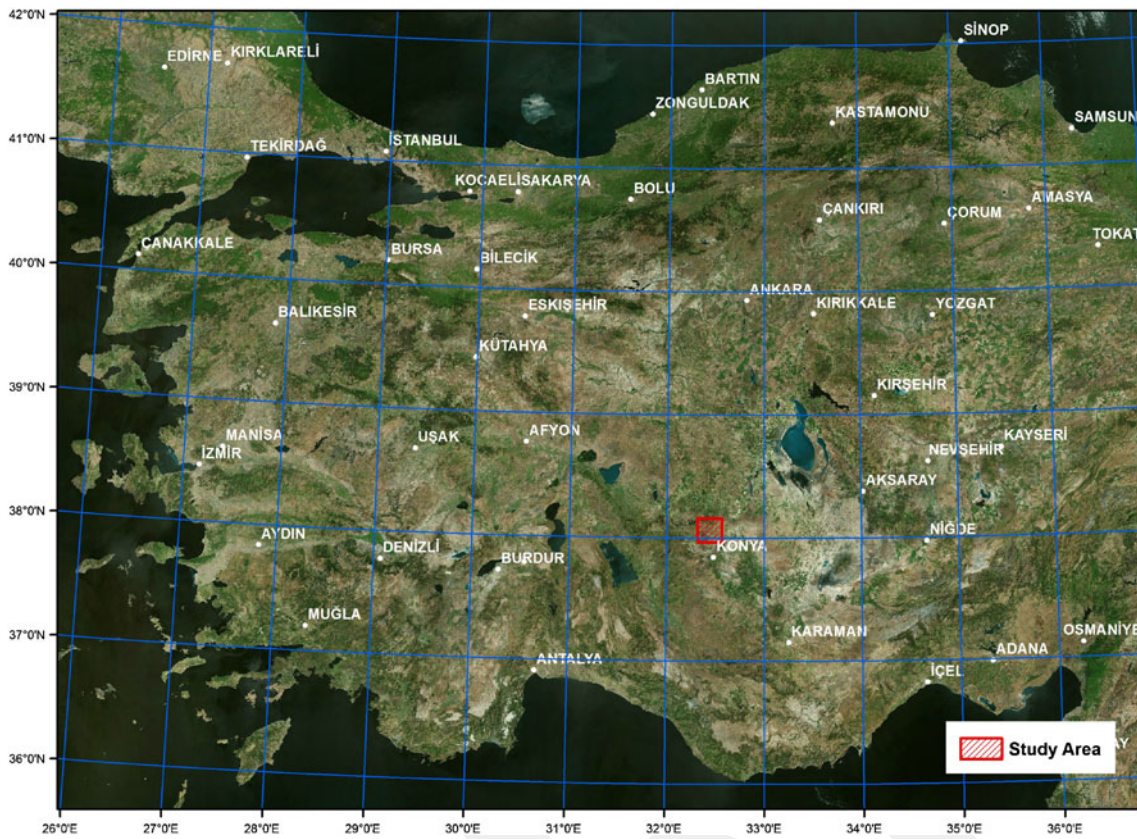
Fig. 1 Study area